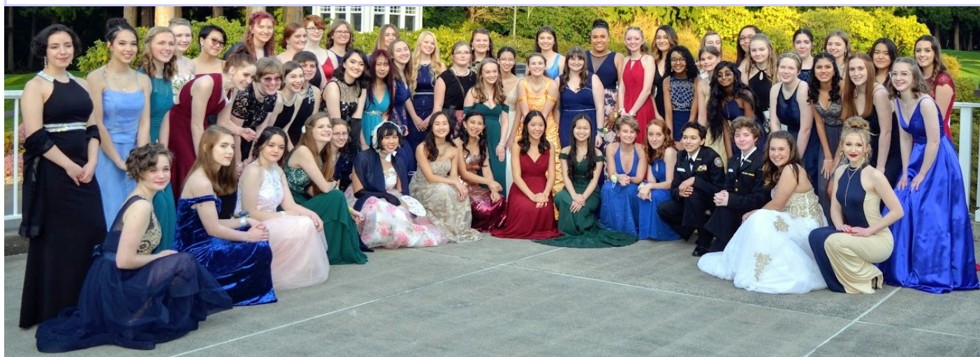
On Saturday evening, 23 March, 147 cadets, administrators, senior parents, and guests attended the annual NJROTC Navy Ball at Sahalee Country Club to celebrate the Navy's 243rd birthday and illustrious history. The evening included a receiving line and a formal ceremony that was made up of the presentation of the Colors, a cake cutting, guest speaker, sit down dinner, senior recognition, royal court announcement and dancing. A great time was had by all!