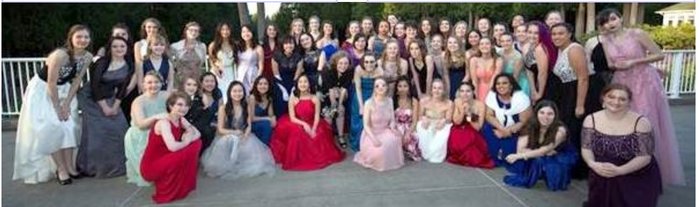
(Below) Female cadets and guests gather for a group picture at the annual Liberty High School NJROTC Navy Ball.

in various physical and fun events. It was a huge success with over 90% of our cadets participating during and/or after school hours. In all, we held nine physical fitness events that included: plank/leg lift hold, combat relay run, push-ups and sit-ups, 8 lb. sand stick hold with squats, wall sit and combat fitness test. After school activities included: three legged race, basketball shooting, dizzy bat relay, and tug-of-war.