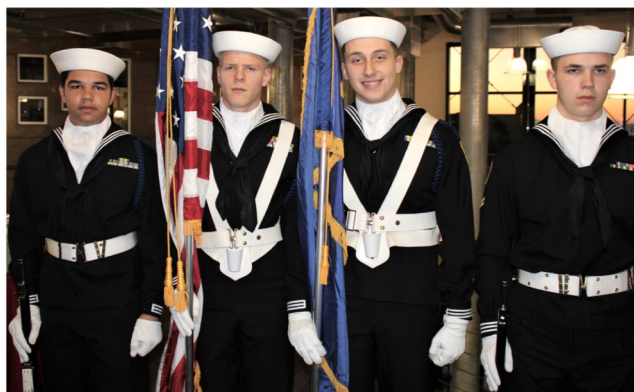
Naval Sea Cadet Color Guard