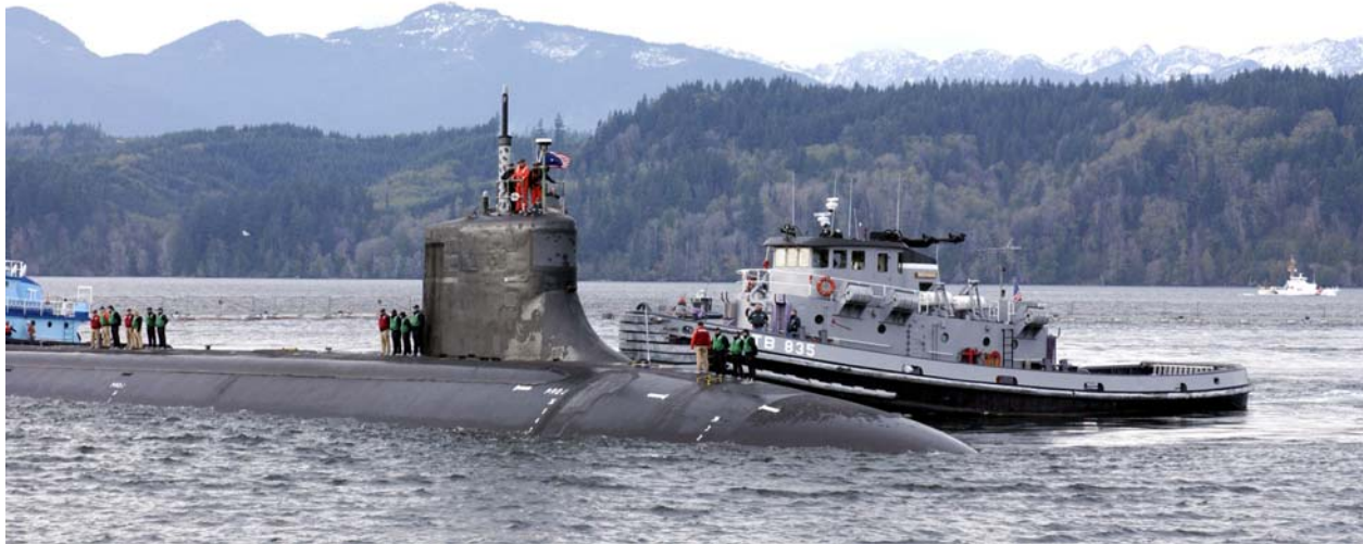
USS Jimmy Carter SSN-23 arriving at Bangor WA for its “First Homecoming”.